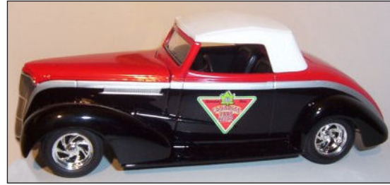
TRD-1B Safety Excellence