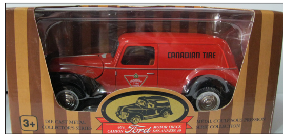
TRP-3R 1940 Ford Panel