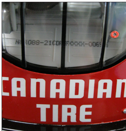
DIN number can be seen through back window