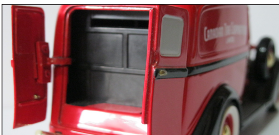
TR1-4R with rear doors open showing coin slot located near top

Not all Canadian Tire die cast are banks and this is particularly true of the race cars. If a vehicle is not a bank it certainly does not diminish it's value, however, if a vehicle is a bank then the key can be important when determining it's value.