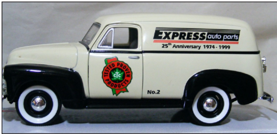
TRX-2B Express Auto Parts

Link, Distribution and Automotive Marketing. There was also a vehicle issued to commemorate the 20th annual slo-pitch tournament for the Foundation For Families.