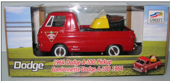
Colour view through box