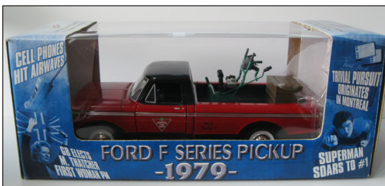
TR3-5R 1979 Ford Pickup

Retail die cast vehicles have a different license plate as described above and are packaged in a much more colourful view through box. This is the easiest way to get started collecting Canadian tire diecast and they are available in the stores usually in November each year.