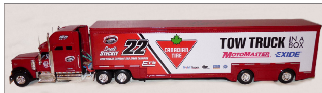
TRS-5R Scott Steckly #22 International 9900ix

Some units are individually numbered although most are not and the newest tractor trailer diecast is also Nascar related so it becomes a cross-over for collectors.