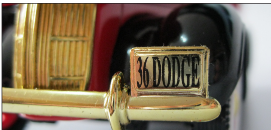
License plate with vehicle type and year TR1-4R ('36 Dodge shown)