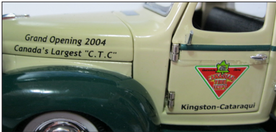
GO-5W Kingston grand opening

From time to time there have been die cast vehicles issued to commemorate grand openings or opening anniversaries of Canadian Tire stores. These vehicles are much easier to identify as they usually have a logo on the vehicle itself marked with the store name and in most cases indicating it is a grand opening along with the year the opening occurred.