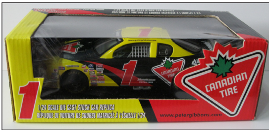
RC-2R Peter Gibbons Red #1

Starting in 2006, Racing Collectables in the United States began making all of their die cast vehicles with a unique DIN - Die cast Identification Number. This number is easily located through the back window of the car. They also offer a free registration of the vehicle for collectors online and a certificate is also available, Visit www.lionelnascarcollectables.com/