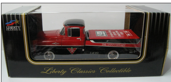
TSP-1R CTCCC 20th Anniversary

Tire issued a 1949 pickup truck in both all silver or all gold. There are other special issue die cast vehicles planned for later this year and next year and these vehicles may replace the TRP series of trucks.