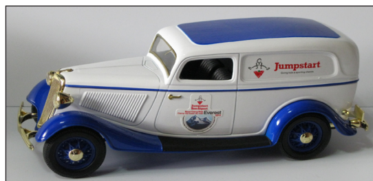
TSP-3W Mount Everest