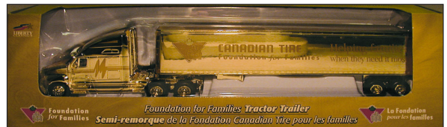
TRS-3Ge Kenworth T2000 English