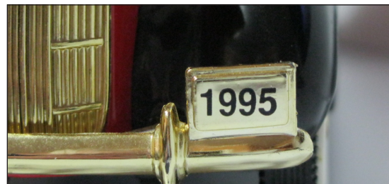
License plate with year of issue TR1-4R-emp (1995 shown)

Retail versions refer to die cast vehicles sold to retail customers in the Canadian Tire stores. Employee versions were offered to Canadian Tire employees only, usually as an incentive or gift and were not available to the general public.