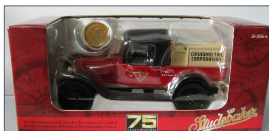
TR2-1R 1922 Studebaker Pickup