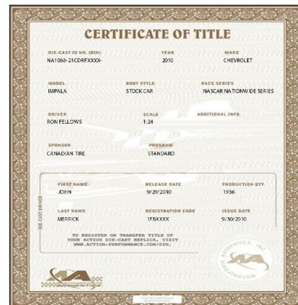
DIN Registration Certificate