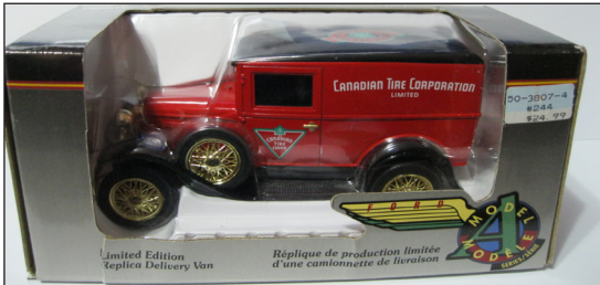
Clear view front and top