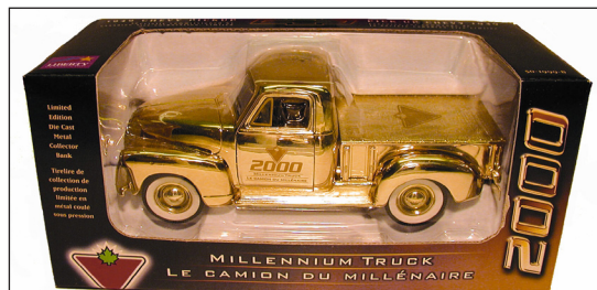
TRM-1G Gold Millenium