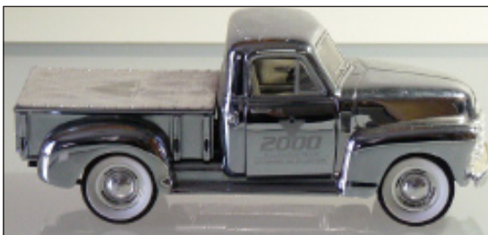
TRM-1S Silver Millenium