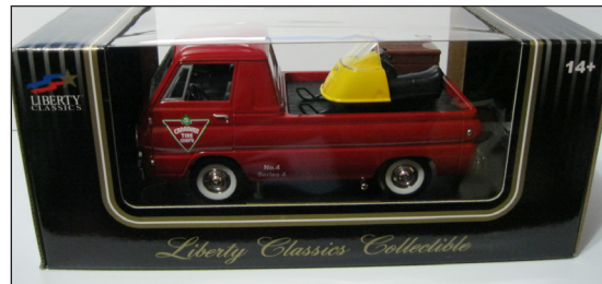
Black view through box - starting in 2002