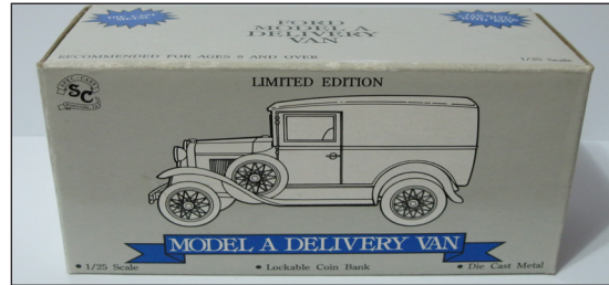
Plain solid or no view box - prior to 2002