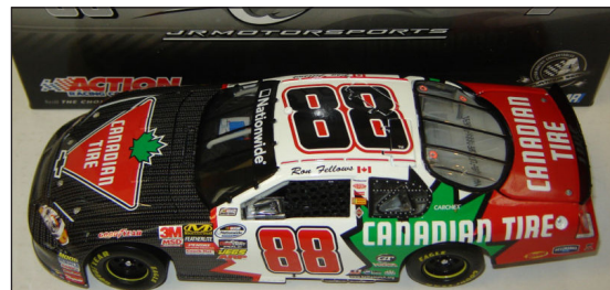
RC-7B Ron Fellows #88 Chevy Impala SS