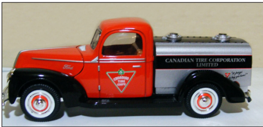
TRP-1R 1940 Ford Tanker

Ford Pickup was available in red or gold and also in English and French versions for both colours.